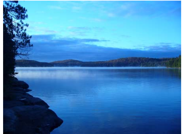
A typical scene in the Bancroft area.